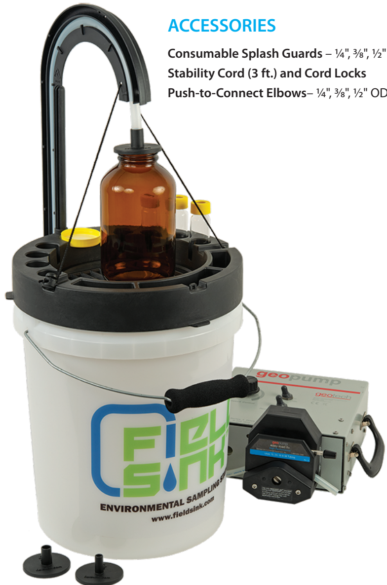
FieldSink being used as a low-flow sampling station. Geopump peristaltic pump, tubing and sample bottles not included.