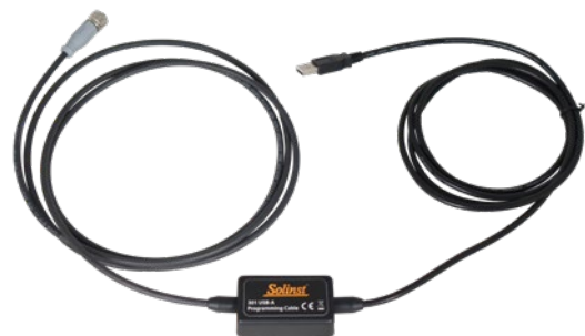
USB-A Programming Cable