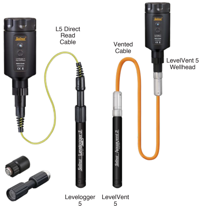
L5 Threaded and Slip Fit Adaptors allow you to directly connect your Levelogger to the Levelogger 5 App Interface.