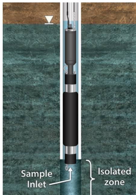
A Model 800M Packer can be used to isolate the sampling zone and reduce purge volumes.

Tag Line: Convenient reel-mounted marked cable, for measured depth deployments. (See Solinst Model 103 Data Sheet).