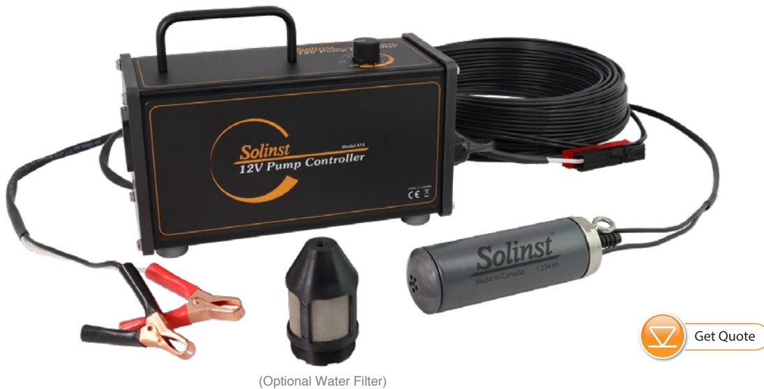
(Optional Water Filter)