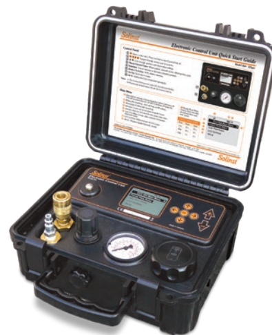
Model 464 Electronic Control Unit (125 psi and 250 psi Models)

These convenient Controllers are rugged, dependable and suitable for all environments. Quick-connect fittings allow instant attachment to dedicated well caps, portable reel units and to an air compressor or compressed gas source.