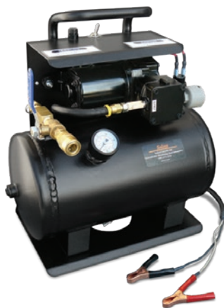
12 Volt Compressor

The compressor operates using 12 volt DC power source, such as a car or truck vehicle battery, and comes with alligator clips. The compressor operates at up to 125 psi and is equipped with a 2 US gallon (7.6 L) air tank which is rated to 150 psi.