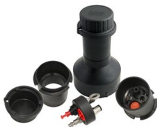
Well Caps for Dedicated Pumps

The caps slip easily onto 2" dia. (50 mm) wells. Adaptors to fit 4" dia. (100 mm) wells are also available. They have quick-connect fittings for the drive and sample tubing.