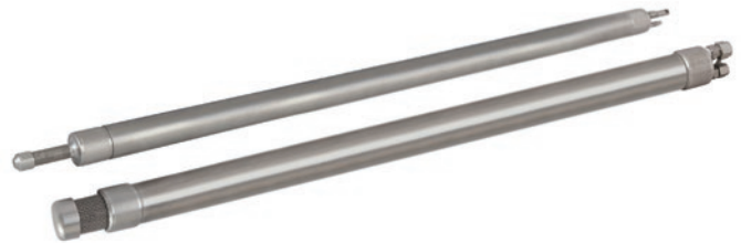
Solinst Bladder Pumps available in Stainless Steel 1" and 1.66" (25 mm and 42 mm).