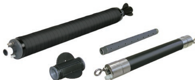
Model 800 Packers 3.9" and 1.8" (99 mm and 46 mm)

Model 800 Low-Pressure Packers can be used with Solinst Bladder Pumps to minimize purge times by reducing purge volumes. This reduces the cost of water disposal and labour. Packers are available in single point or straddle packer designs, and in sizes to fit 2" (50 mm) to 5" (127 mm) dia. wells. (See Model 800 Data Sheet.)