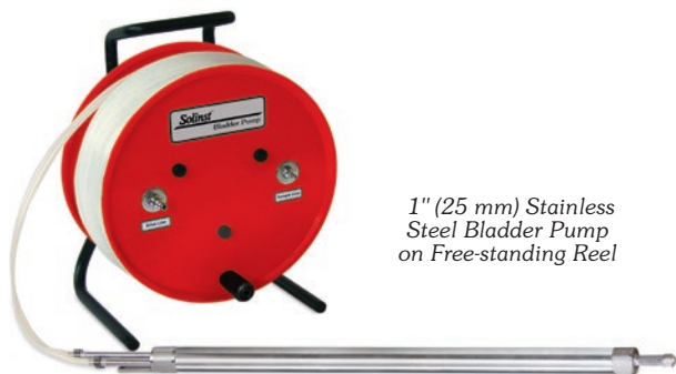
1" (25 mm) Stainless Steel Bladder Pump on Free-standing Reel

They are supplied on a free-standing reel. The rugged systems are very convenient and easy to transport. Tubing fittings on the reels and controller are compression fittings, allowing quick set up in the field. The Solinst Model 103 Tag Line can be used to lower and support the pump in the well (see Model 103 Data Sheet).