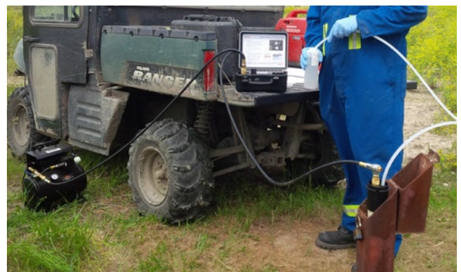
Sampling with a Dedicated Bladder Pump using Portable, Rugged, Easy-to-use, Compressor and Controller

For water level monitoring there is an access hole to fit a Solinst Model 101 Water Level Meter or Levelogger. An eyebolt is provided for a pump support cable or for suspension of a Solinst Levelogger, (see Model 3001 Data Sheet) or other device.