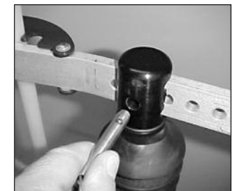
Clevis pin and clamp arm