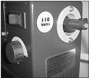
Speed control knob, on/off switch and plug

Before starting the Hydrolift-2 check again that the unit is firmly attached to the well casing and that sufficient tubing (approximately 5 feet) exists between the tubing clamp and the tubing discharge clamp. Adjust the speed control knob to the minimum setting and check that the unit is switched off before attaching the power cord.