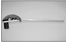
– Clamp Arm & Tubing Clamp Bracket