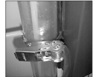
Ratchet tie-down belt

Open the Tubing Clamp located on the adjustable clamp arm and place the tubing in the clamp's jaws, leaving enough tubing (approximately 5 feet) above the jaws to allow the tubing to reach the tubing discharge clamp, and then tighten the clamp until the jaws are completely closed. The tubing clamp is designed to accept 1" OD, 5/8" OD and 1/2" OD polyethylene or Teflon tubing. Now position the tubing such that it will not chafe on the well casing and lock the clamp arm in place by inserting the clevis pin through the fork and the mating hole in the clamp arm.