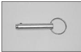
– Clevis Pin