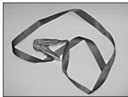
– Ratchet Belt