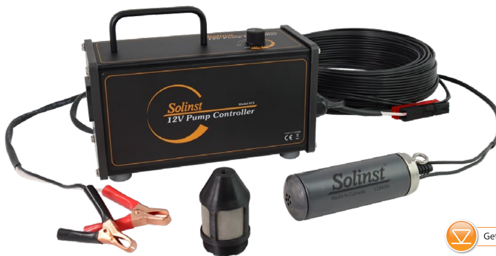
(Optional Water Filter)