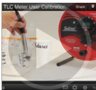
Calibration Video 2-Point using 1413 & 5000 µS/cm

User calibration allows for adjustment of a TLC Meter accurately when the probe has been degraded slightly due to mechanical, biological or chemical affects. If readings of calibration solutions are outside the 5% accuracy range, the user can conduct a recalibration at 1, 2, 3, or 4 separate conductivity levels, using standard solutions (1413, 5000, 12,880, or 80,000 µS/cm). User calibrations are required regularly; the frequency will depend on usage and monitoring environment. As a precaution, calibration can be done before every usage.