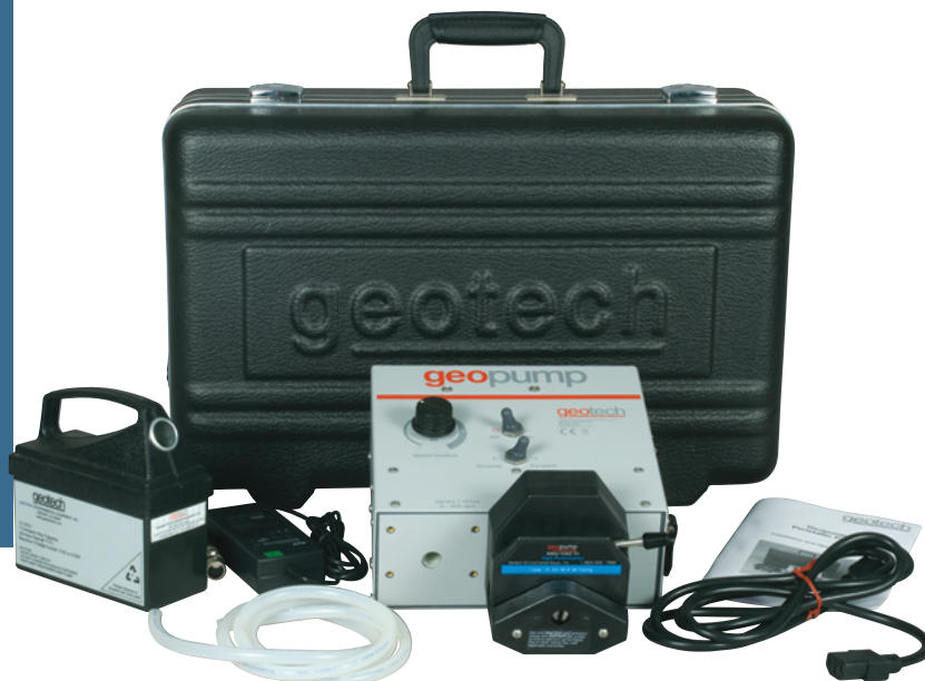
Geopump™ Peristaltic Pump Series II Kit with optional Easy-load® II pump head, modular battery, 5 ft. (1.5 m) tubing, carrying case and power cord

SERIES II Geopump™ Peristaltic Pumps are available in AC only, DC only, or AC/DC combination. They have two pumping stations which can also be piggy-backed for multi-station pumping. The first pumping station has a variable speed of 30 to 300 RPM and the second station 60 to 600 RPM.