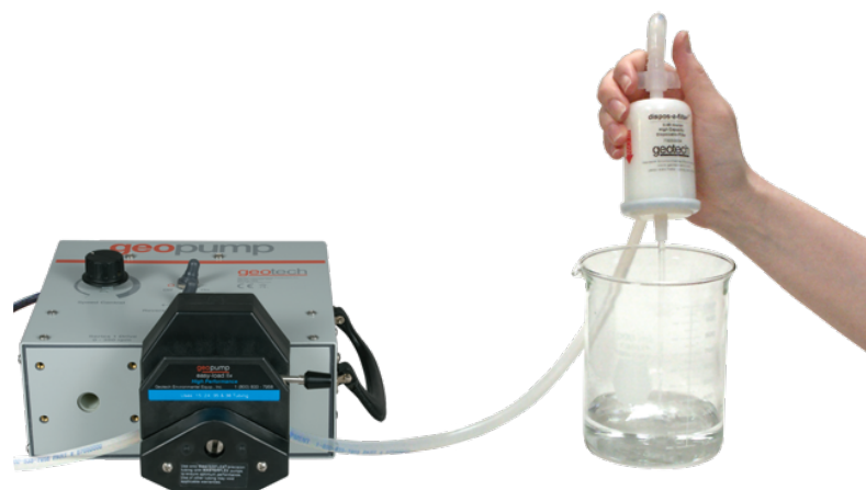
Sample collection with the Geopump™ Peristaltic Pump Series II with optional Easy-load® II pump head (dispos-a-filter™ capsule sold separately)