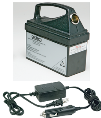
Geopump™ 12V Portable Battery and Charger