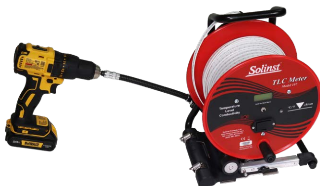
Solinst TLC Meter with Power Winder Installed to Make Temperature and Conductivity Profiling Applications Easier